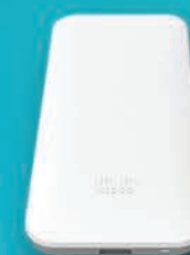
Access points £154.51 RSP